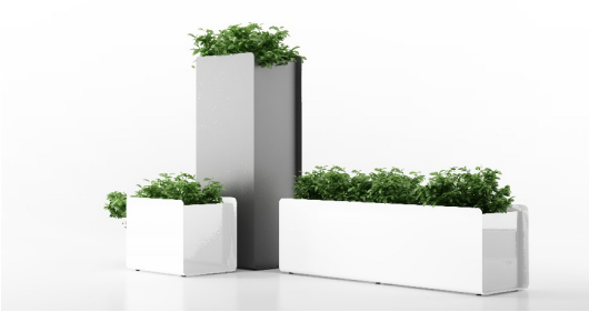
Crepe Planters MTR: SF4