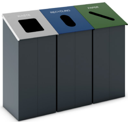
Slope Waste Receptacles MTR: WR3