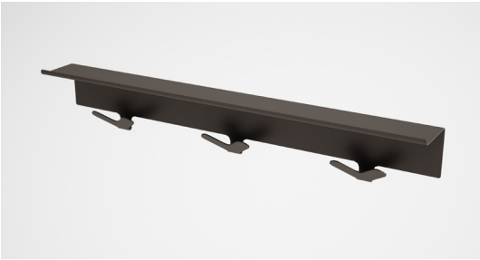
Stal Coat Hook Strips MTR: HK1