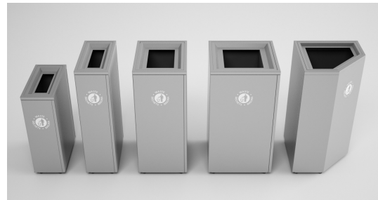
Valuta Waste Receptacles