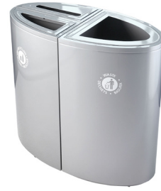
Sotare Waste Receptacles MTR: WR3