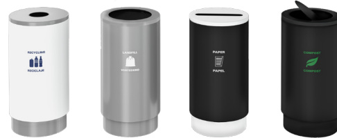
Cirkel Waste Receptacles MTR: WR3