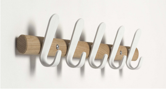
Krok HJH Coat Hook Strips MTR: HK1