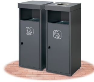
Retto Outdoor Waste Receptacles