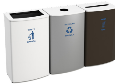
Trada Waste Receptacles MTR: WR3