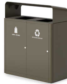
Umea Outdoor Waste Receptacles