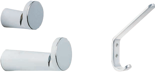
K-Series Coat Hooks