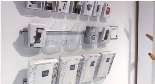
Dacapo Brochure & Leaflet Holder