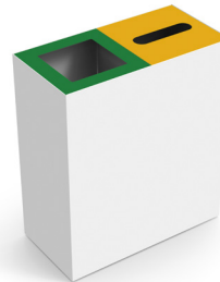
PIC Waste Receptacles MTR: WR3