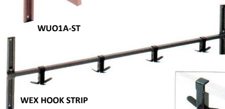
WEX HOOK STRIP