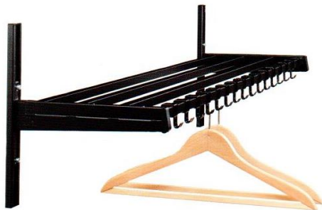
WUO1A-ST W/SR34 & MG17B